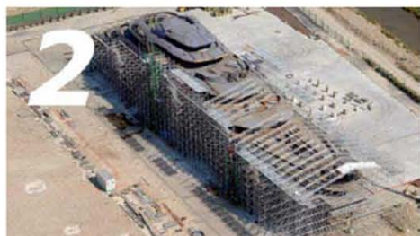
Privilege Two 137m | Privilege | 2015

Supposed to be called White Pearl and supposed to have a length 147 metres, this project is understood to become the largest sailing yacht of the world. Everything about her is confidential, even the date of her order, which could be at the end of 2011. There have been many discussions about her, including three masts and a revolutionary design. It's hard to know the truth from rumour, but undoubtedly she'll turn heads when launched.