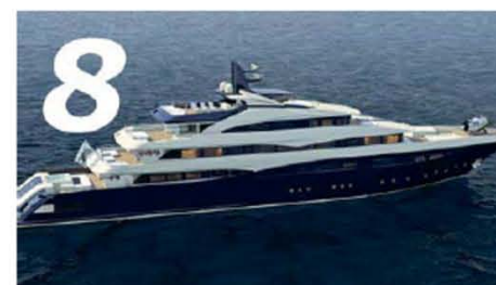
131 74m | CRN | 2014

Few details are known about the next motor yacht under construction at Golden Yachts. Her construction has started in Greece, and this 75 metre project should already hit the water in 2014.