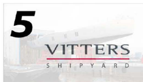
3069 85m | Vitters | 2015