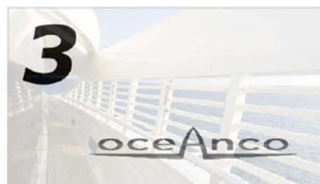
no name 110m | Oceanco | 2016