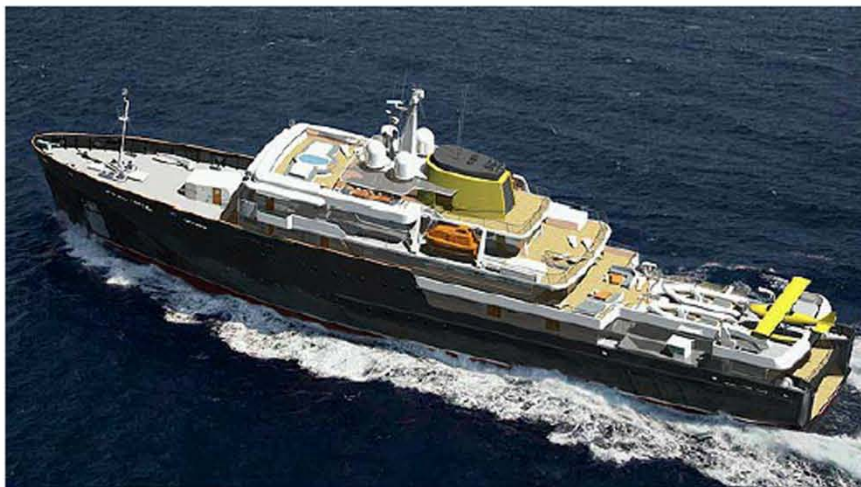
Pierre J. Kubis Designs

A new order has come for a 76.6-meter explorer yacht by Piriou. The new vessel has been designed for operating in extreme conditions, from very hot (+50 degrees C) to the very cold (-20 degrees C). Remember this new yacht will be an explorer yacht and must have the tenders and toys to help execute the exploring themed events.