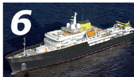
no name 76.6m | Piriou | 2015

Few details are known at the moment about the future flagship of the Vitters yard. The project 3069 will be an all-aluminum sailing yacht of 85 metres, designed by Tripp with an interior by Doelker + Voges. Her delivery is scheduled in 2015. Read me