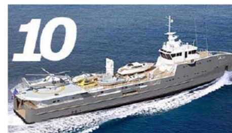
Sea Axe 67.25m | Damen | 2014

Currently under construction in a famous American yard (for confidential reasons, we can't reveal the name for the moment), this project will become their new flagship. No other details are known for the moment, but we can estimate her launch date as 2014.