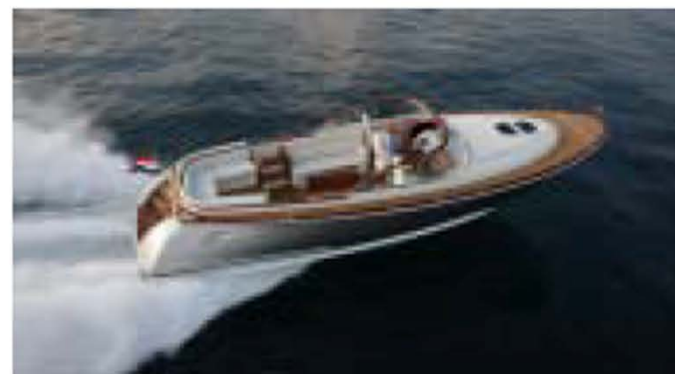
Wajer Osprey 37 yacht tender for the 75m Piriou explorer yacht

Related Briefs: 76m Piriou Yacht, France, Holland, Netherland, Netherlands, Piriou, The Netherlands, Wajer & Wajer