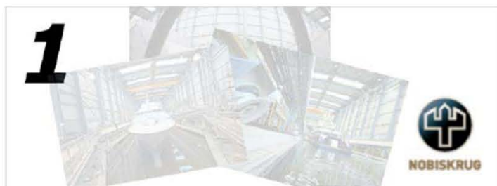
White Pearl | 147m | Nobiskrug | 2016

Rarely has a year seen so many rumours and official orders over 100m. No less than four yachts were recorded this year, including two sailing yachts, and 2013 will give us more details about a couple of other projects.