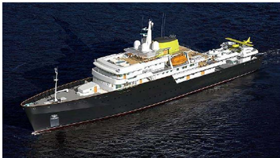
Piriou will build this 76.6m explorer motor yacht in 36 months

http://www.boatinternational.com/2012/06/08/new-order-for-76-6m-explorer-motor-yacht-at-piriou/