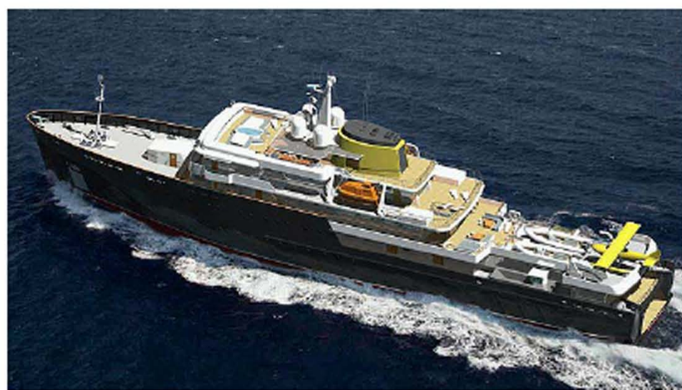
Special features include a dedicated platform for a seaplane

The yacht will have a diesel-electric propulsion system with six generators producing power for twin 1,500kW pods. This will give a top speed of 15 knots, a cruising speed of 11 knots and an impressive range of 12,000 nautical miles. An additional central pump-jet will allow cruising in shallow waters, lakes or rivers, and is independently capable of a top speed of 6 knots. In keeping with the trend for a lighter impact on the environment the yacht will have among other features exhaust fume filters and sewage and grey water treatment plants.